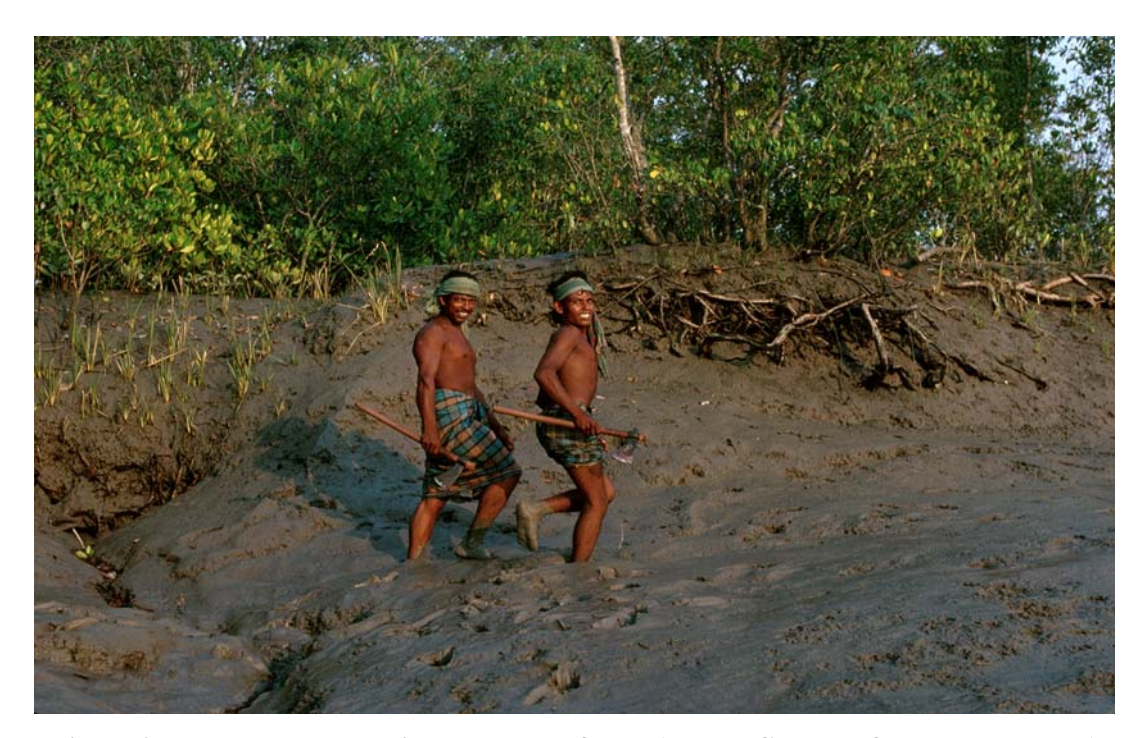
Figure 2: Woodcutters entering mangrove forest

The number of households depending on SRF was determined in the following way: for each of the 17 upazilas of the Sundarban Impact Zone, the population and total number of households were taken from BPC data. The percentage of households depending on SRF was taken from the SBCP Baseline Study (2001). This percentage is used to calculate the total number of households depending on SRF. The results are compiled in Table 3, zila-wise for the total Impact Zone and for Shyamnagar upazila in particular.